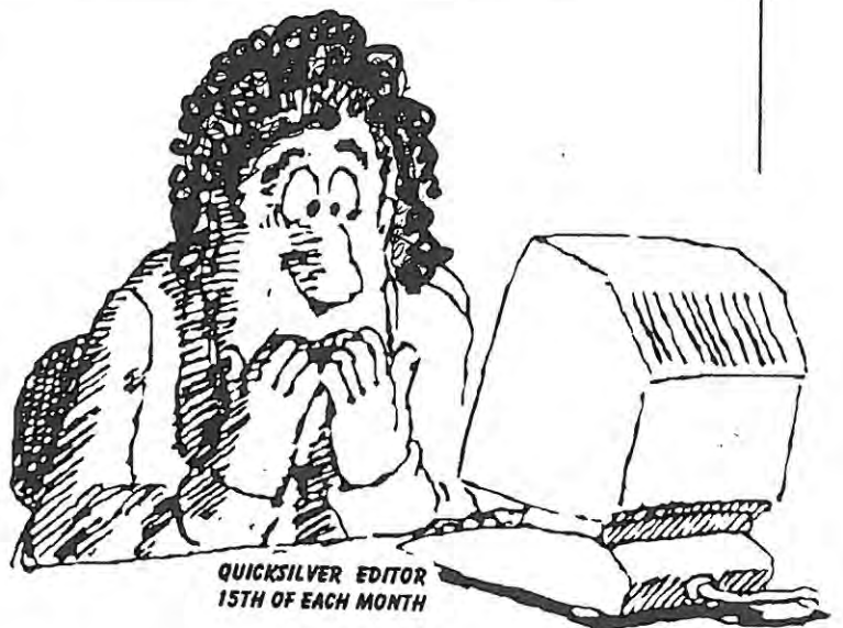
QUICKSILVER EDITOR 15TH OF EACH MONTH