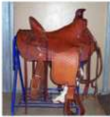
MacPherson Basket Weave Buckaroo Saddles