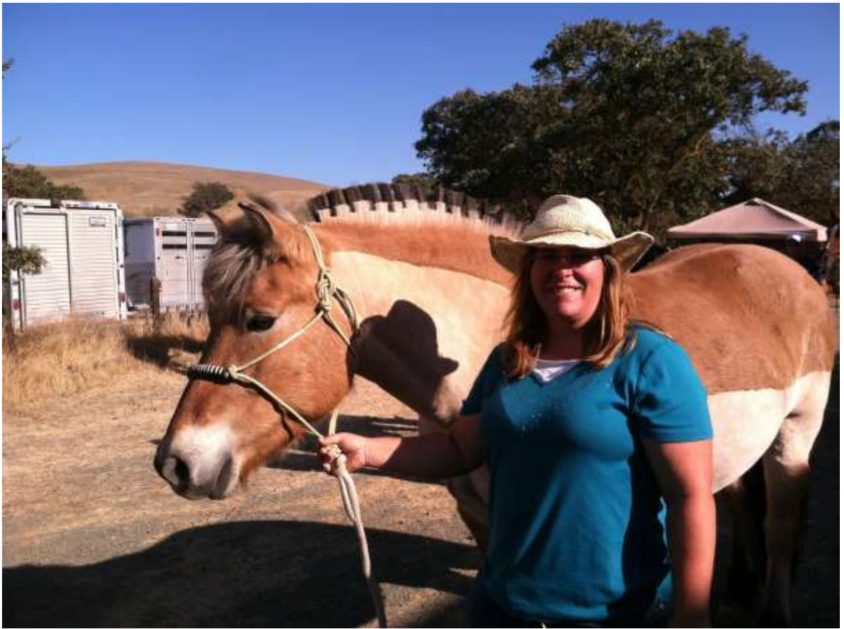
"Lilja"—the Fjord that won the "most interesting mane" award