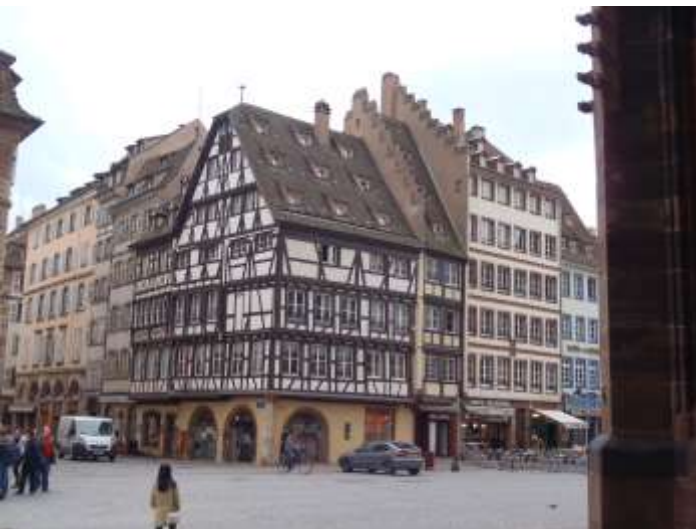
Upper L—door handle on the cathedral Upper R—Hand-wrought hinge on the cathedral door Lower L—Architecture more German/Swiss than French Lower R—A memorial plaque in the Strasbourg Cathedral