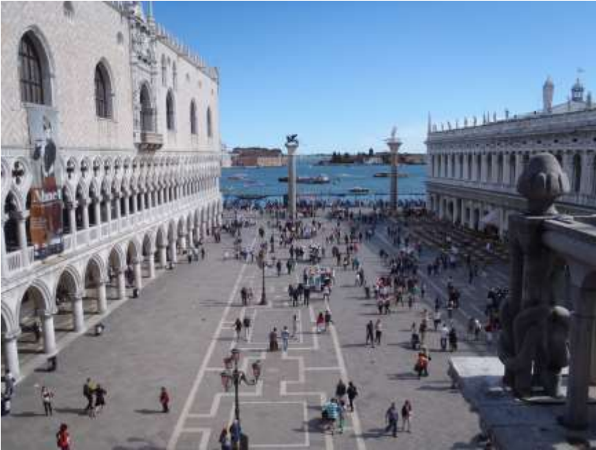
L—The Doge's Palace , R—the Campanile at San Marco's Square