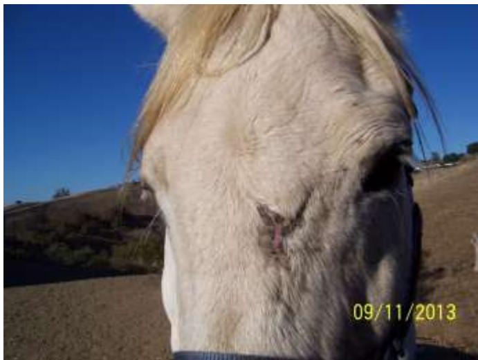
Photos taken after healing took place