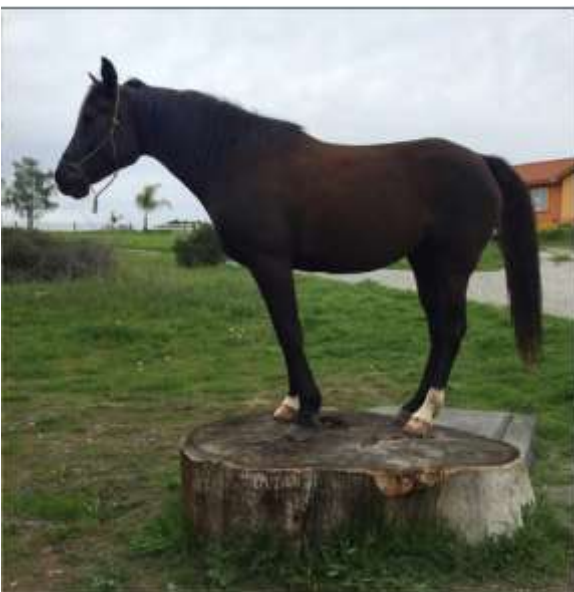
Tess on one of our first rides and liberty work on the pedestal

As the months went by, I noticed that Tess's bottom was higher than her withers. By the end of our first year together, her withers had caught up. She is now between 15.1-15.2 hands. She proved to have a lot of heart, to be fun to ride, and have a lot of suspension, which my dressage teacher admired. Unfortunately, I have started having some undiagnosable back pain. Tess's height and suspension became challenging for me. She has made great progress in her dressage lessons and is learning how to engage her hind end doing flat work and going downhill. She attacks uphill climbs with ambition, rarely if ever spooks, eats and drinks on the trail like a champ. I continue to love her comic personality. However, friends of mine who have watched her movement have said "Now that's a horse I would have ridden when I was 20!" For me the problem is not only her suspension, but also the challenge to 67-year-old knees when dismounting from that height.