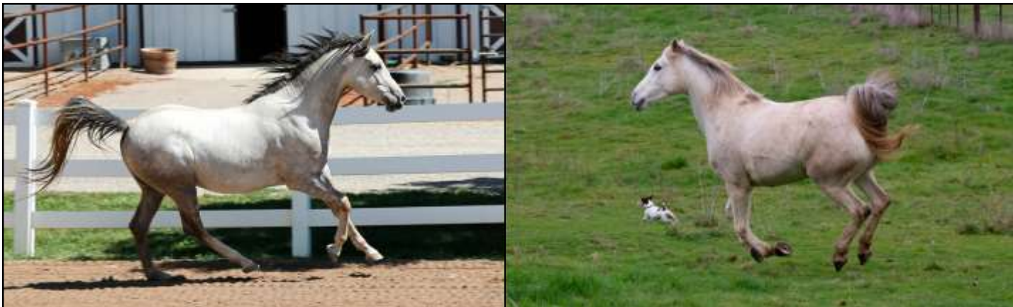
Sahal Kinndah on the left and Maggie with Finnie the Jack Russel Terrier on the right

Sahal is four coming five in February. He was ridden about 25 times at Garrett's and has fairly nice ground manners. He arrived here last Saturday, November 24 th , so we are just getting to know each other. He traveled well from Colorado. The shipper described him as having an "old soul in a young body." He reminds me very much of Mocha Mirah - Maggie, the small, stout and very talented mare I used to ride.